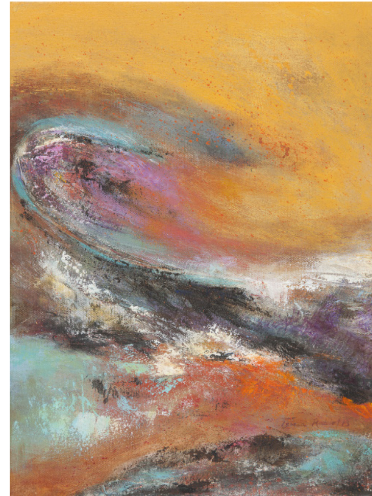
"Cosmic vision" 2013 Acrylic on canvas 36 x 28 cm