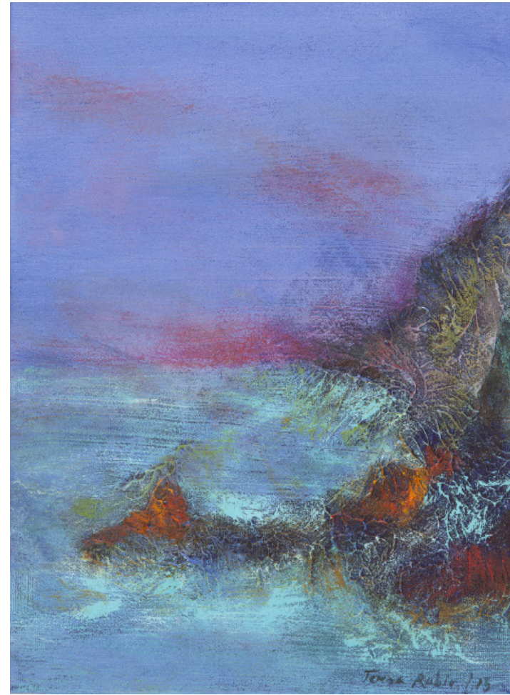
"Sounds of the ocean" 2013 Acrylic on canvas 36 x 28 cm