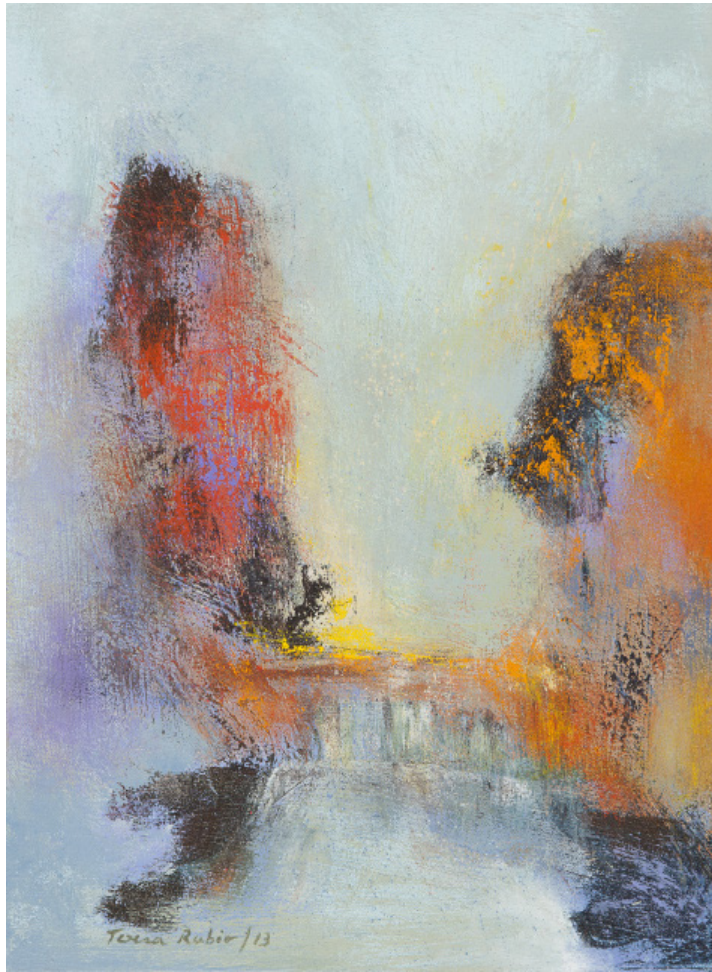
"Dreams of cosmos" 2013 Acrylic on canvas 38 x 28 cm