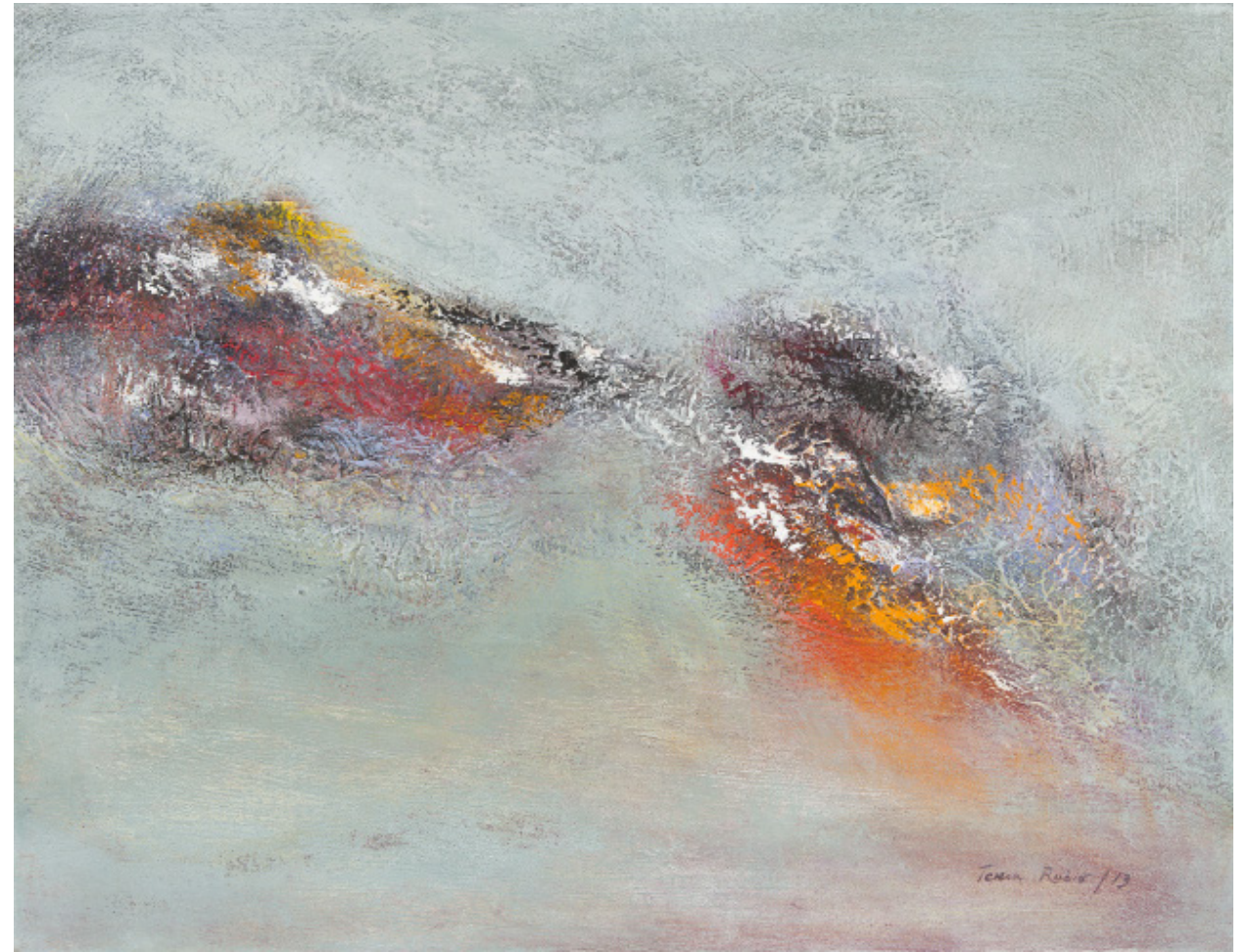
"Inlets of the soul" 2013 Acrylic on canvas 40 x 50 cm