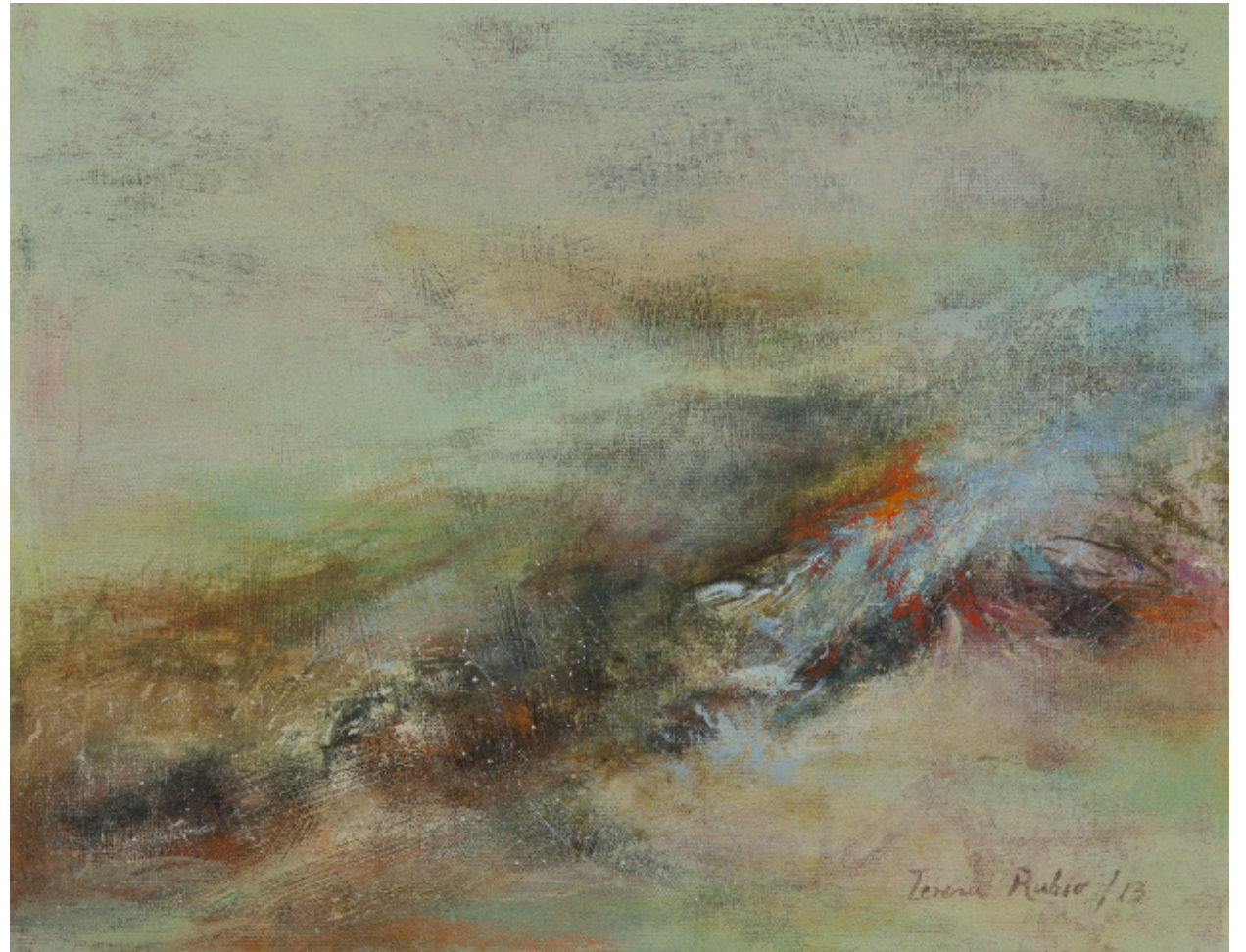
"Glimpse" 2013 Acrylic on canvas 28 x 36 cm