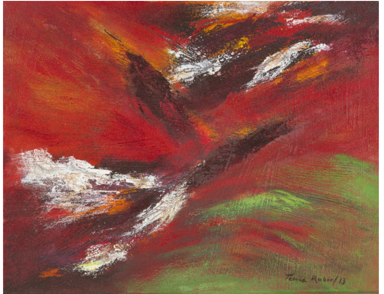
"Soaring" 2013 Acrylic on canvas 28 x 36 cm