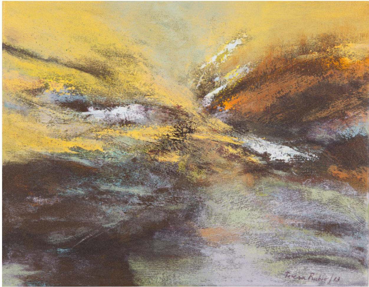
"Beams" 2013 Acrylic on canvas 30 x 40 cm