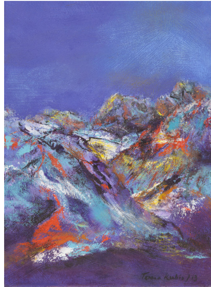
"Summit" 2013 Acrylic on canvas 36 x 28 cm