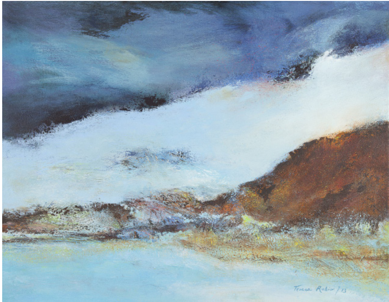
"Faith" 2013 Acrylic on canvas 40 x 50 cm