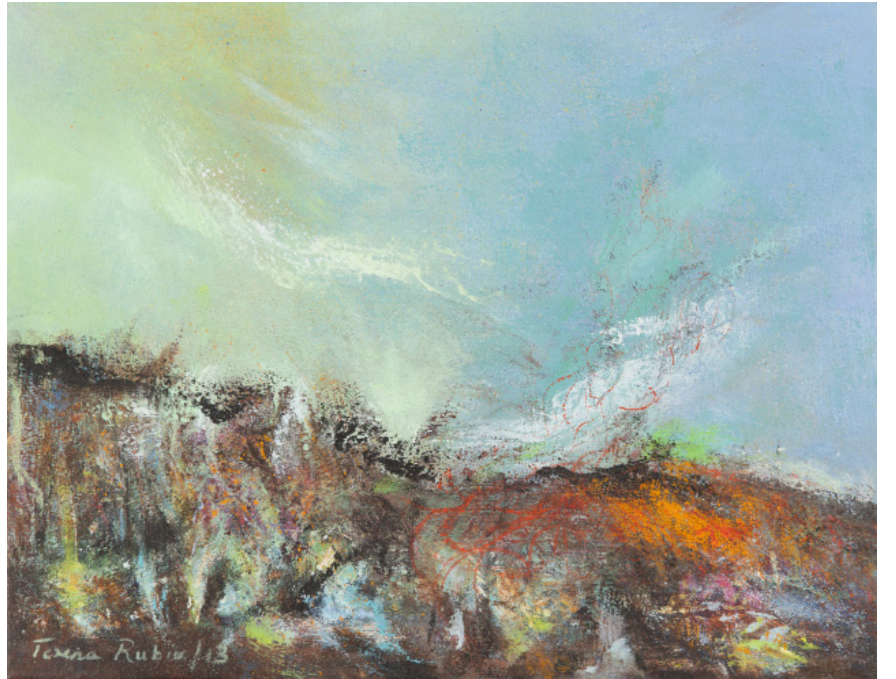
"Swirl" 2013 Acrylic on canvas 28 x 36 cm