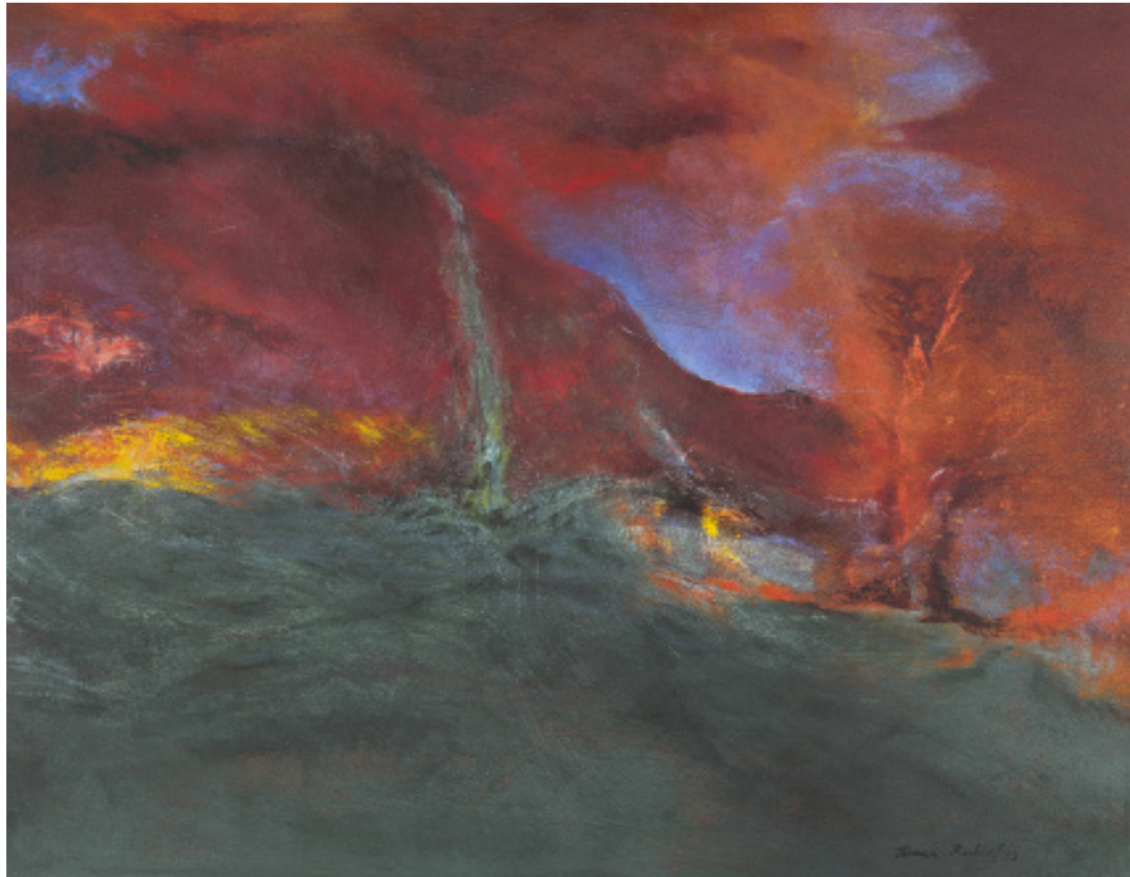
"Magical insight" 2013 Acrylic on canvas 60 x 70 cm