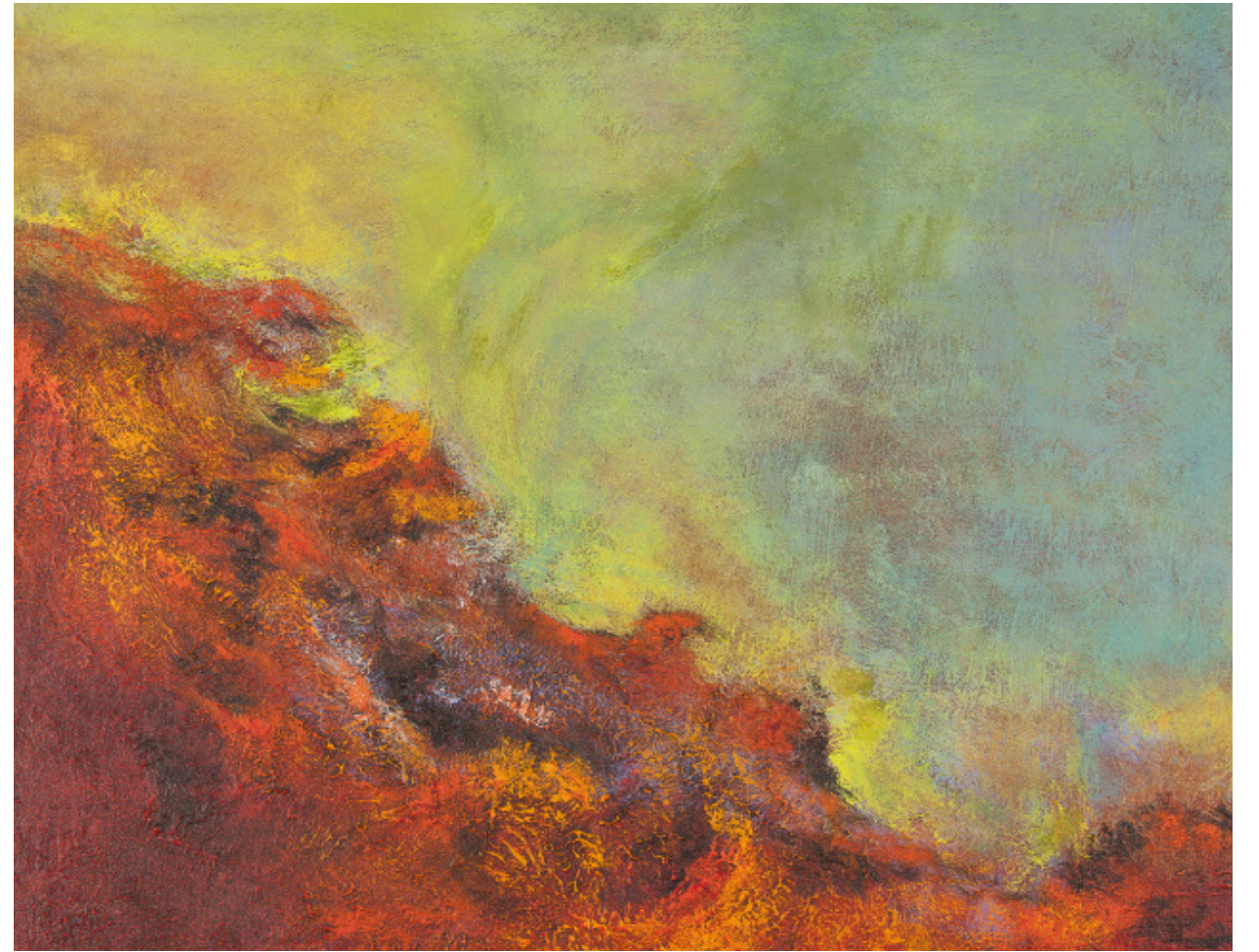
"Dynamic power" 2013 Acrylic on canvas 60 x 70 cm