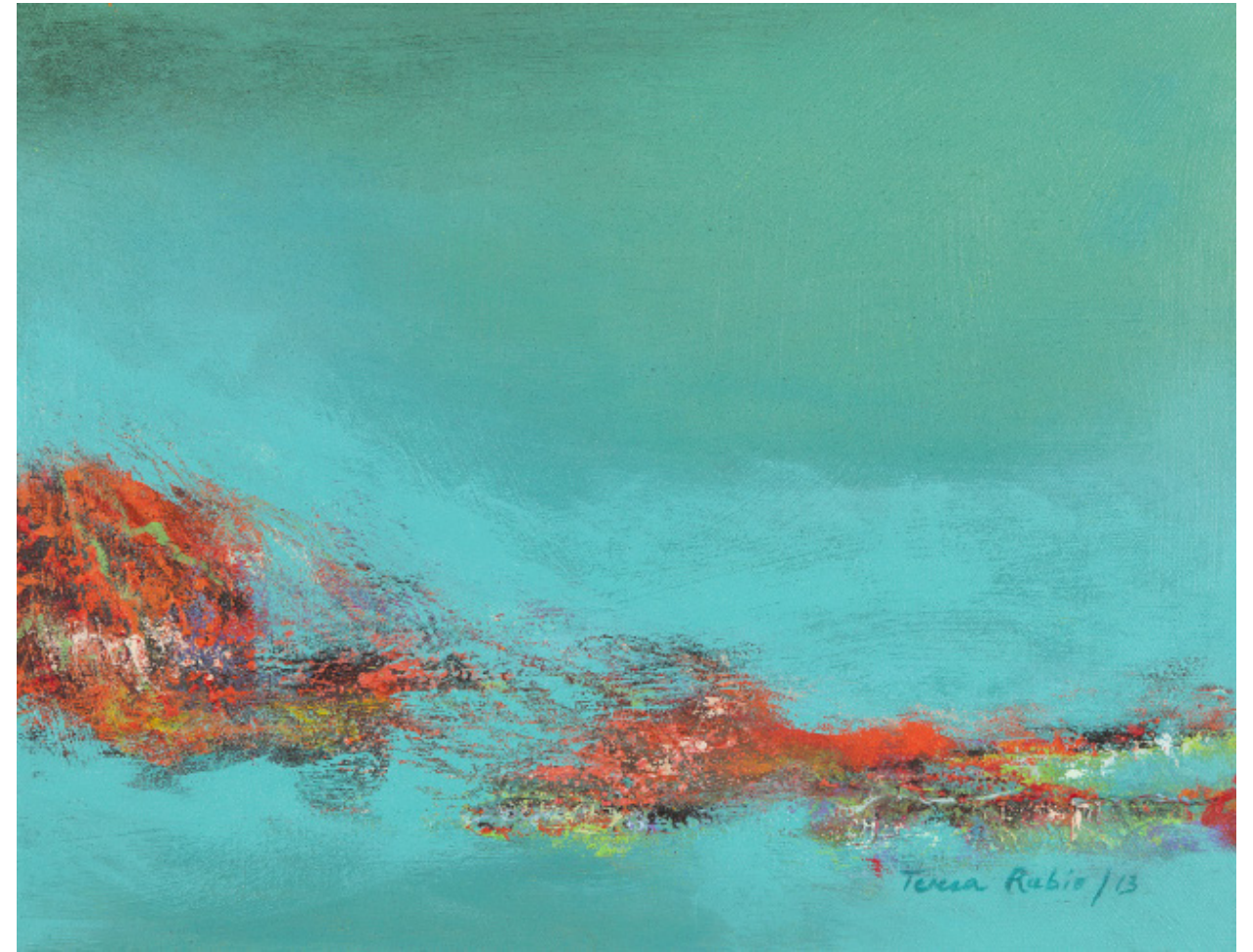
"Quiet depth" 2013 Acrylic on canvas 28 x 36 cm