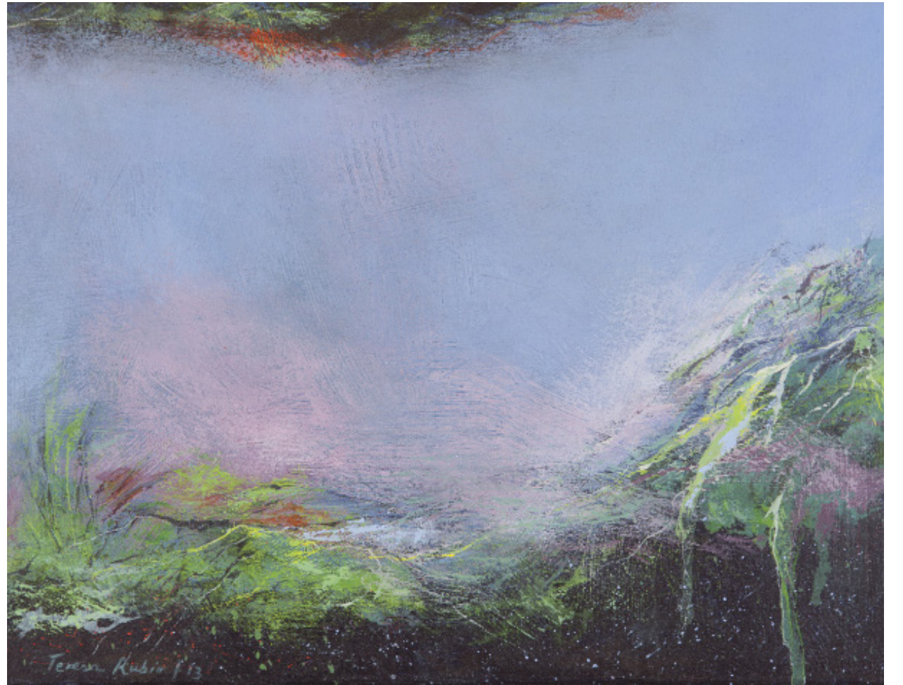
"Evanescent" 2013 Acrylic on canvas 30 x 40 cm