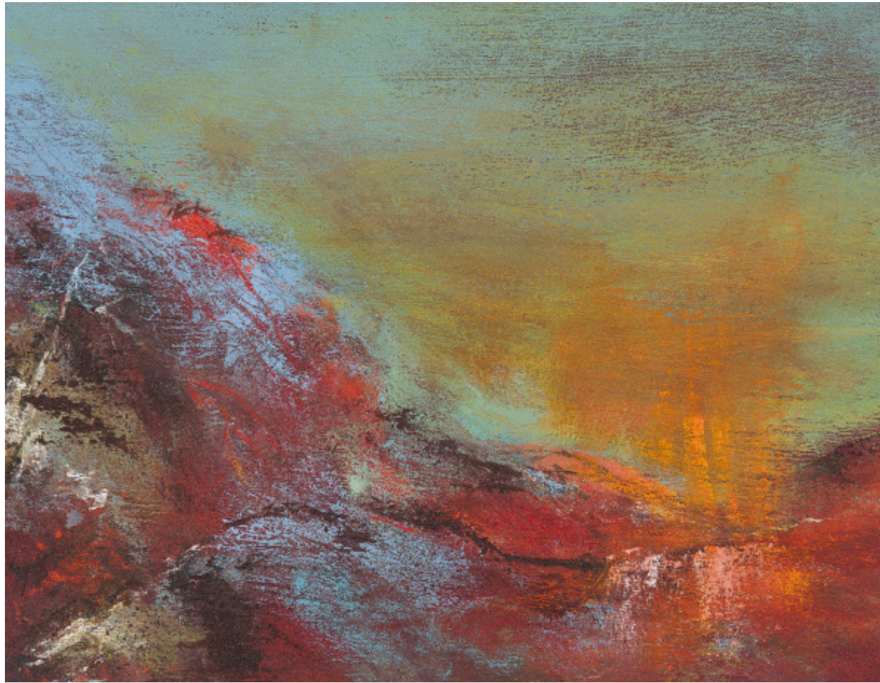
"Dawn" 2013 Acrylic on canvas 28 x 36 cm