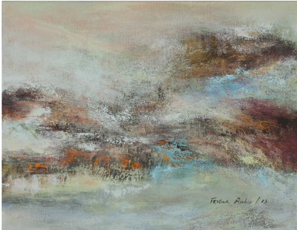
"Inmersed" 2013 Acrylic on canvas 30 x 40 cm