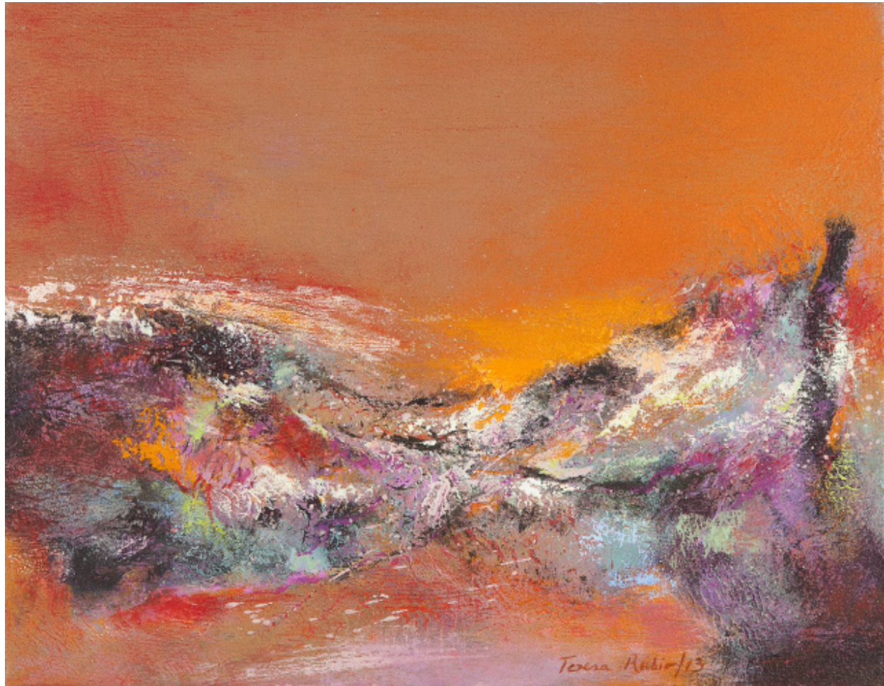
"Wonder" 2013 Acrylic on canvas 30 x 40 cm