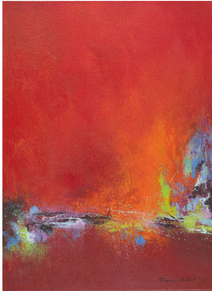
"Mirage" 2013 Acrylic on canvas 40 x 30 cm