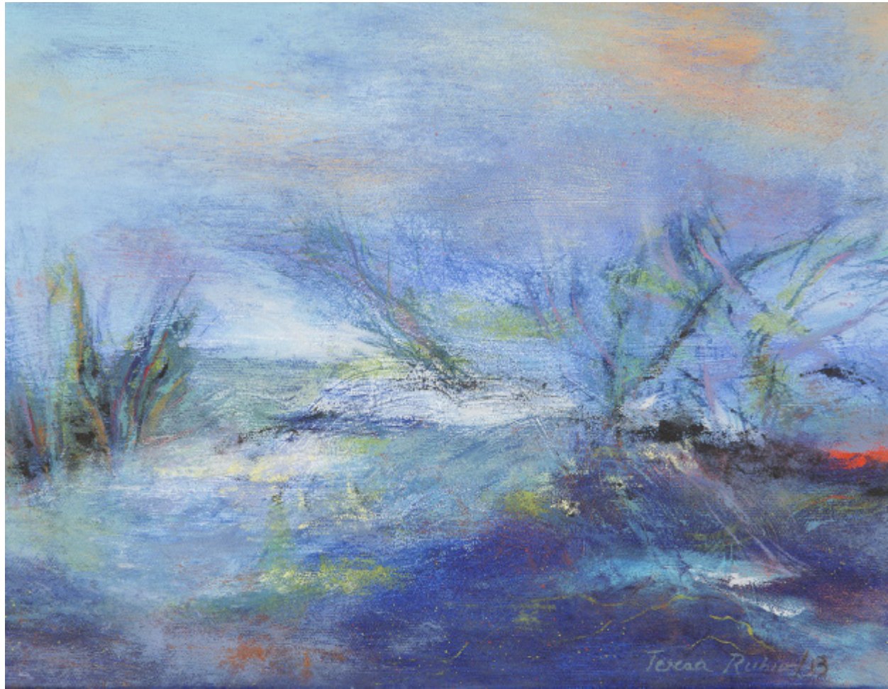
"Idyll" 2013 Acrylic on canvas 28 x 36 cm